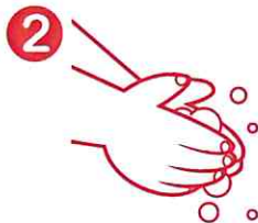
2 PALM TO PALM