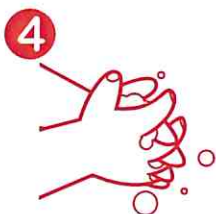
4 FINGERS INTERLACED