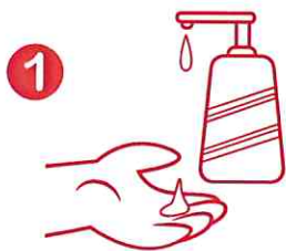
1 USE SOAP

Keeping hands clean is one of the most important things we can do to stop the spread of respiratory illnesses like flu and COVID-19.