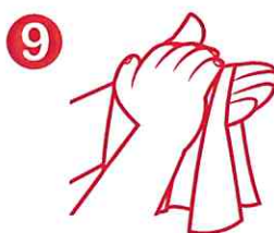
9 DRY HANDS