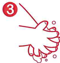
3 BACK OF HANDS