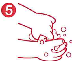
5 BASE OF THUMBS